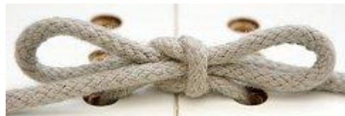
Standard Shoelace knot