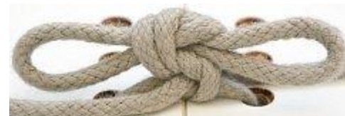
Double Ian Shoelace knot