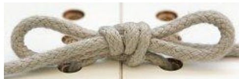
Mega Ian Shoelace knot