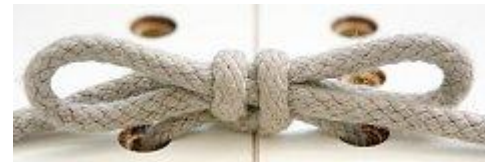
Ian Secure Shoelace knot